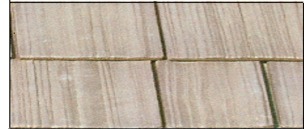
Weathered Gray Cedar